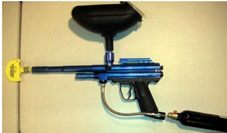
Figure 2.3: Completely Assembled Paintball Gun