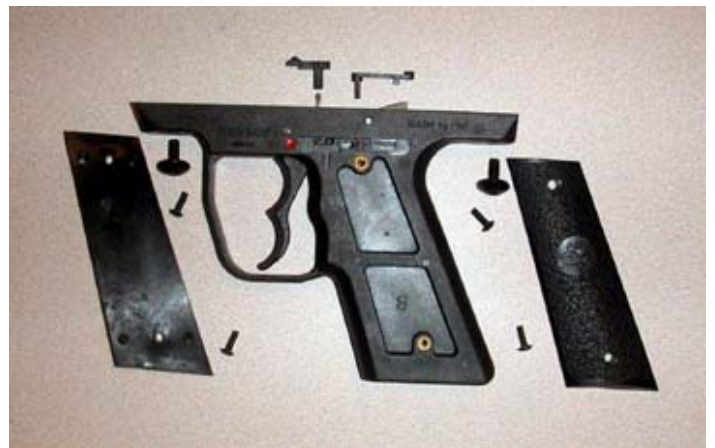
Figure 2.5: Disassembled Handle: Trigger, Frame, Grips