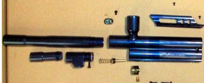
Figure 2.2: Disassembled Body: Barrel, Vertical Feed Receiver, Sight Rail, Valve, and Pressure Chamber