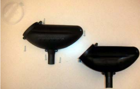
Figure 2.1: Disassembled Hopper