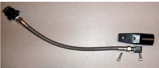
Figure 2.4: Disassembled CO 2 Assembly: Port Reducer, Hose, CO 2